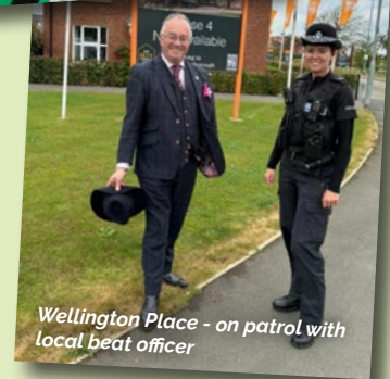
Wellington Place - on patrol with local beat officer