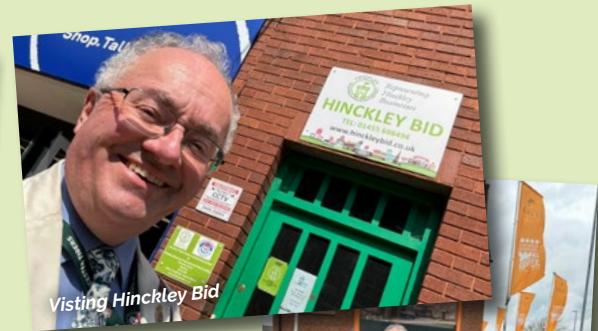
Visiting Hinckley Bid