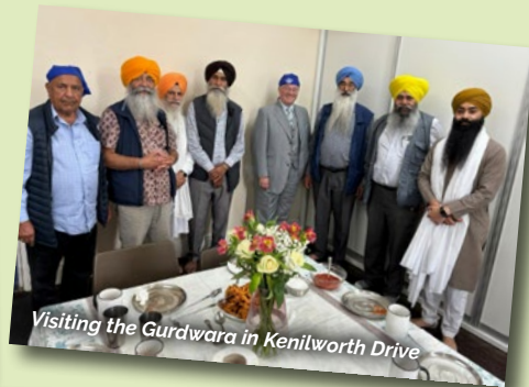
Visiting the Gurdwara in Kenilworth Drive